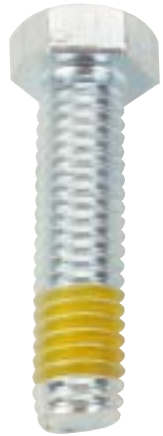
YELLOW 360° APPLICATION