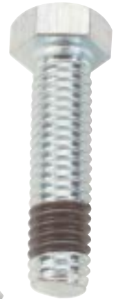
BLACK 360° APPLICATION

THE BRADLEY GROUP OF COMPANIES' NYLON THREAD LOCKER™ can be applied on both internal and external threads from a patch (90-120°) to a full 360° coverage. This resilient, environmentally safe material is formulated to upgrade any fastener to a re-usable, self-locking fastener that will automatically feed and requires no curing time. The nylon applied 360° will, in addition to locking the fastener, aid in sealing the fastener.